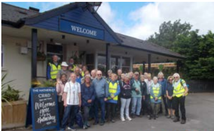
Wednesday morning Health Walkers outside the Hatherley Inn, a starting point alternating weekly with Up Hatherley Library.