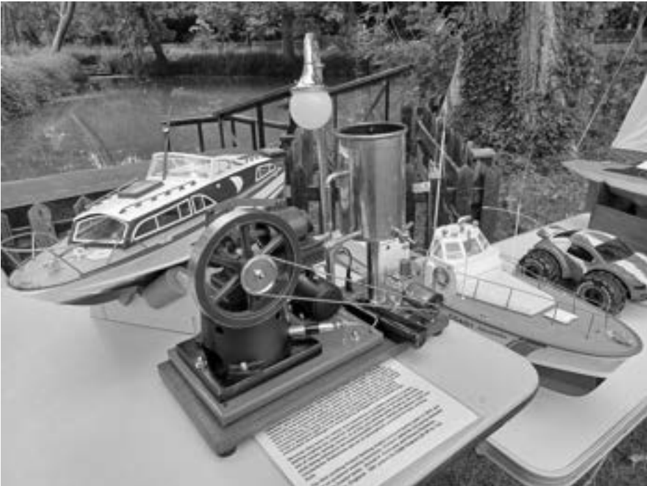
A selection of splendid models belonging to members of the Hatherley Miniature Railway and Model Boats